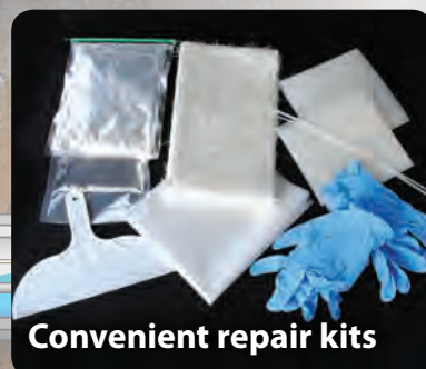
Convenient repair kits